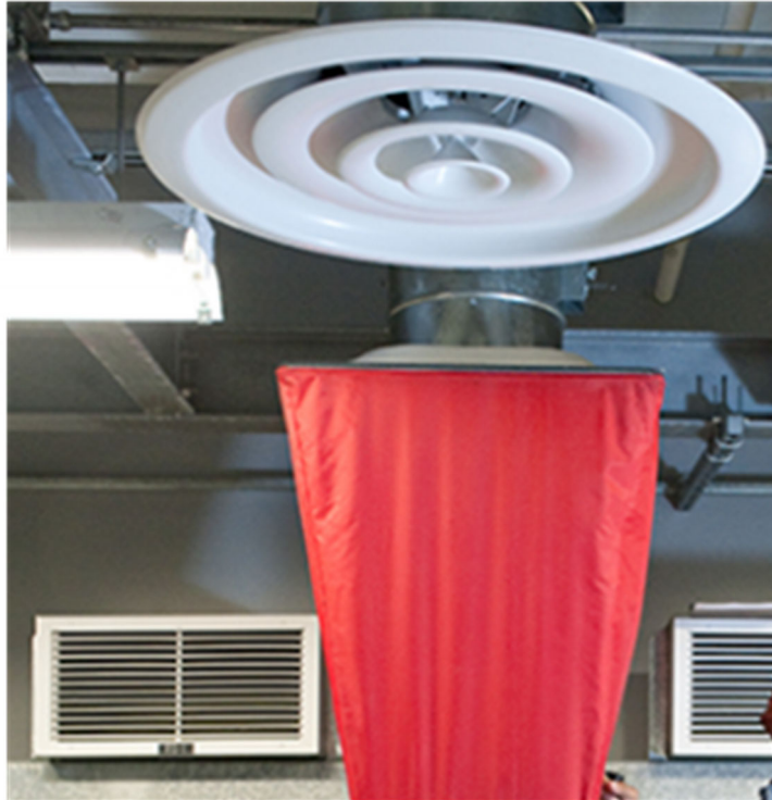
Figure 1 Testing and balancing of HVAC airside components.